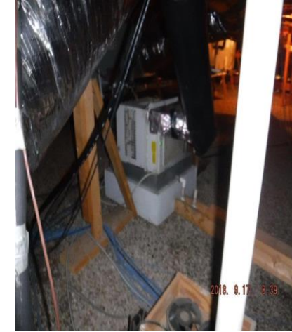
AC for Server Room