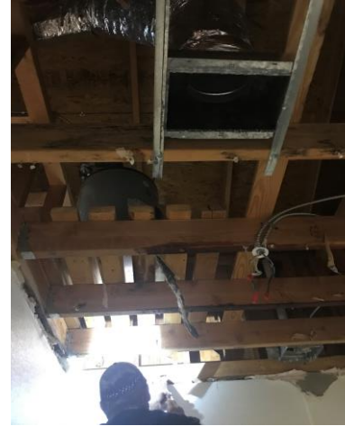
No access to water heaters